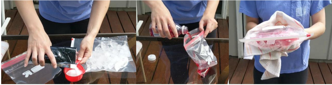
Figure 2. Slushy Demonstration Set Up