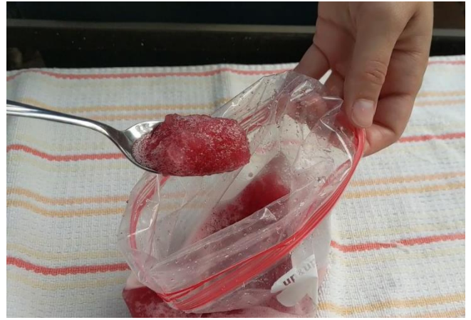
Figure 1. Demonstration final product.