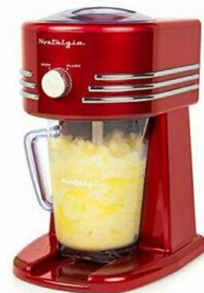
Figure 3. Slushy made in a blender with ice and fruit juice from Nostalgia Electrics

All substances have a freezing point, or the temperature at which a substance will freeze and become solid. The natural freezing point of pure water is 32 °F or 0 °C.